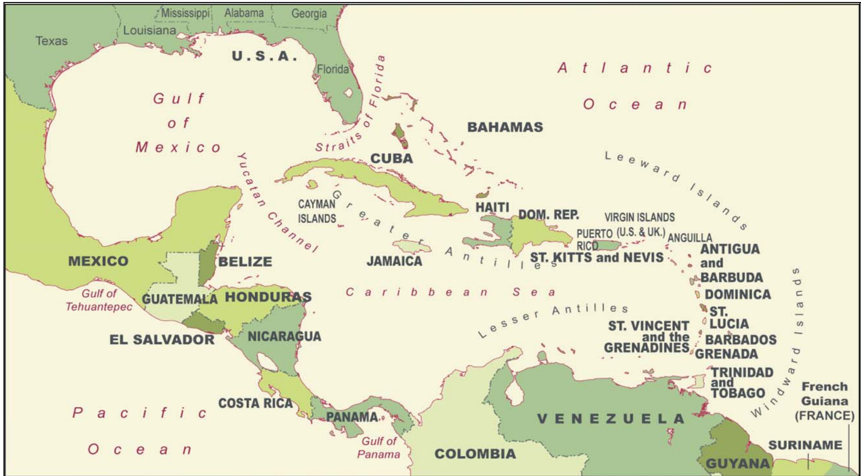
Figure 1. Map of the Caribbean Basin